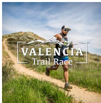
VALENCIA Trail Race 50K Ultra/Half Marathon/10K VALENCIATrailRace.com