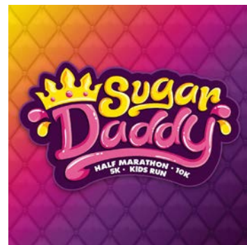
Sugar Daddy Race Half Marathon/10K/5K/Kids SugarDaddyMarathon.com