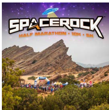
SPACEROCK Trail Race Half Marathon/15K/10K/5K SPACEROCKTrailRace.com