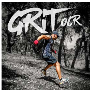
Grit OCR Obstacle Course Race GritOCR.com